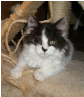
Jack Sparrow after eye surgery