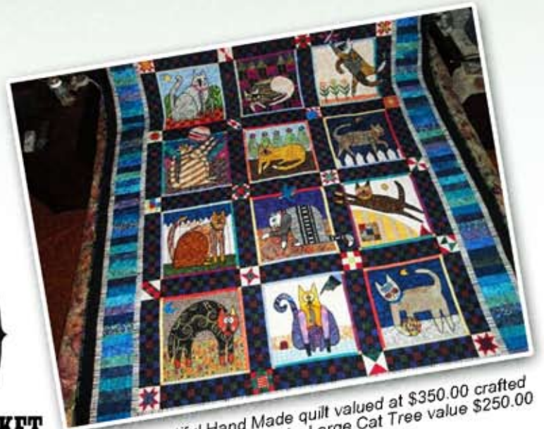
Beautiful Hand Made quilt valued at $350.00 crafted and donated by Maxine Harris; Large Cat Tree value $250.00