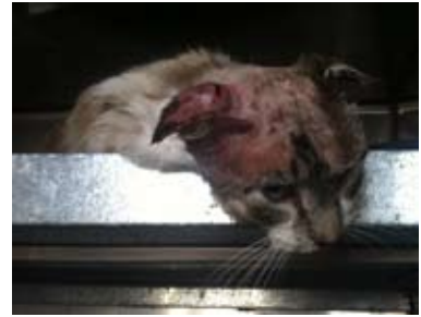
The old tom is doing much better now that he's warm and fed and been treated by the veterinarian.