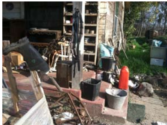
Deplorable conditions where the cats were found.